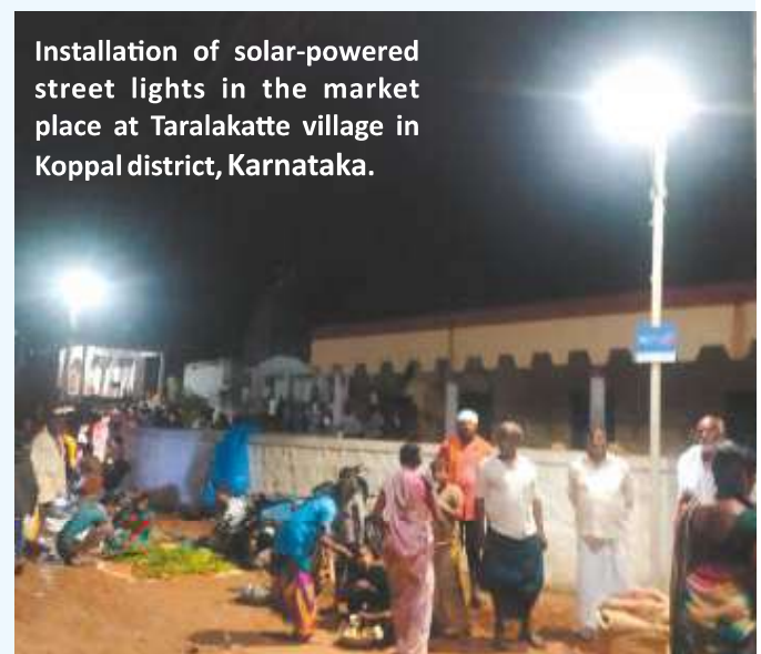
Installation of solar-powered street lights in the market place at Taralakatte village in Koppal district, Karnataka.