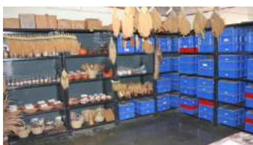
Community seed bank