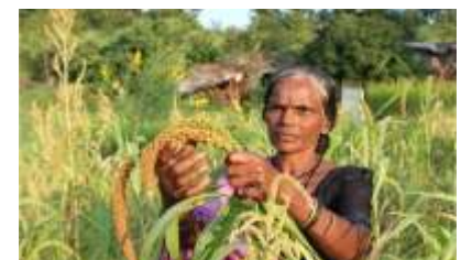
Foxtail Millet Diversity