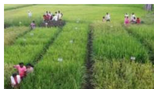
On Farm Conservation Centre