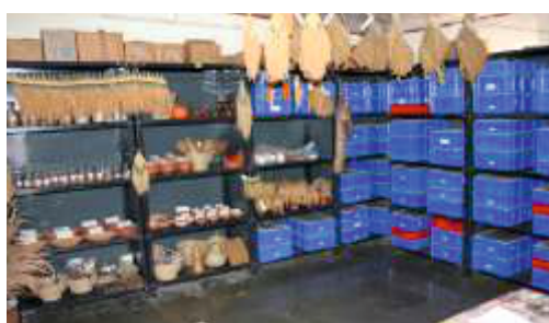
Community seed bank