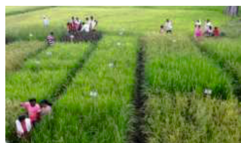
On Farm Conservation Centre