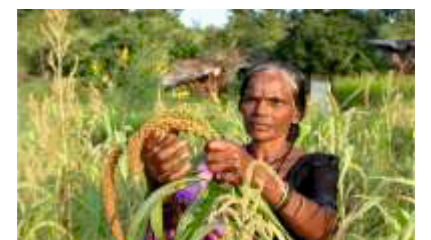
Foxtail Millet Diversity