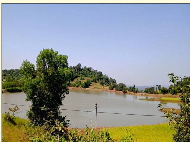
Strengthening of Water Source