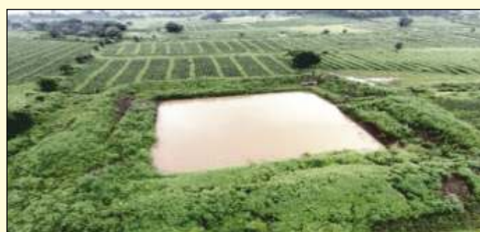
Farm Pond Network model