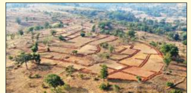
Soil protection on degraded land