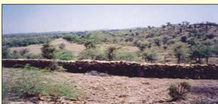
Silvi-pasture on commons