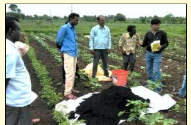
Bio-char production and application